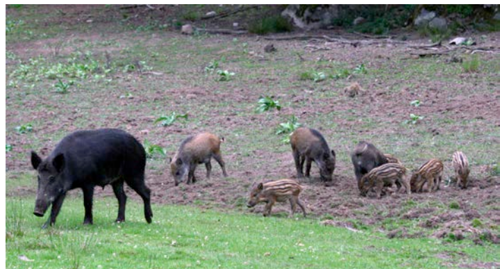
Figure 1. Sow with her piglets rooting for food. Young piglets have characteristic stripes, but after 3-4 months these stripes disappear and the fur gets reddish-brown.

The wild boar was present in Sweden until the 18 th century when it became extinct. It was missing for about 200 years before it was reintroduced, but only in enclosures. Captive wild boars escaped from enclosures in Scania and Södermanland in the later 1970's and established wild populations. Rapid increases of the free-living wild boars occurred and in 1983 the estimated number of free-living wild boars in Sweden was about 300. In 1987 the Swedish government decided that the wild boar should be considered as a part of the Swedish fauna and the wild boars began spreading throughout the country. Less than 30 years later, estimates suggest that there are more than 150 000 wild boars in Sweden. However, estimates of wild boar numbers are relatively uncertain since inventory is difficult. Today the wild boars have reclaimed many areas of their former range and in regard to the increased cull and number of road traffic accidents it seems as if the population is still increasing and expanding geographically.